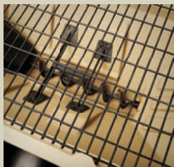
Auger Feed System