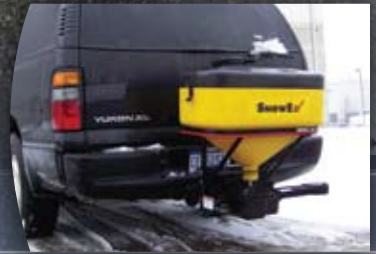
SP-325 w/ optional Pivot Pal mount