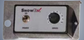
WEATHER-RESISTANT VARIABLE SPEED CONTROLLER (SP-325)