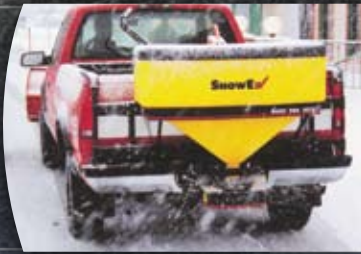
SP-1075 w/ optional pivot mount

NO ENGINES, NO PULLEYS, NO SPROCKETS, NO BELTS, NO CHAINS!