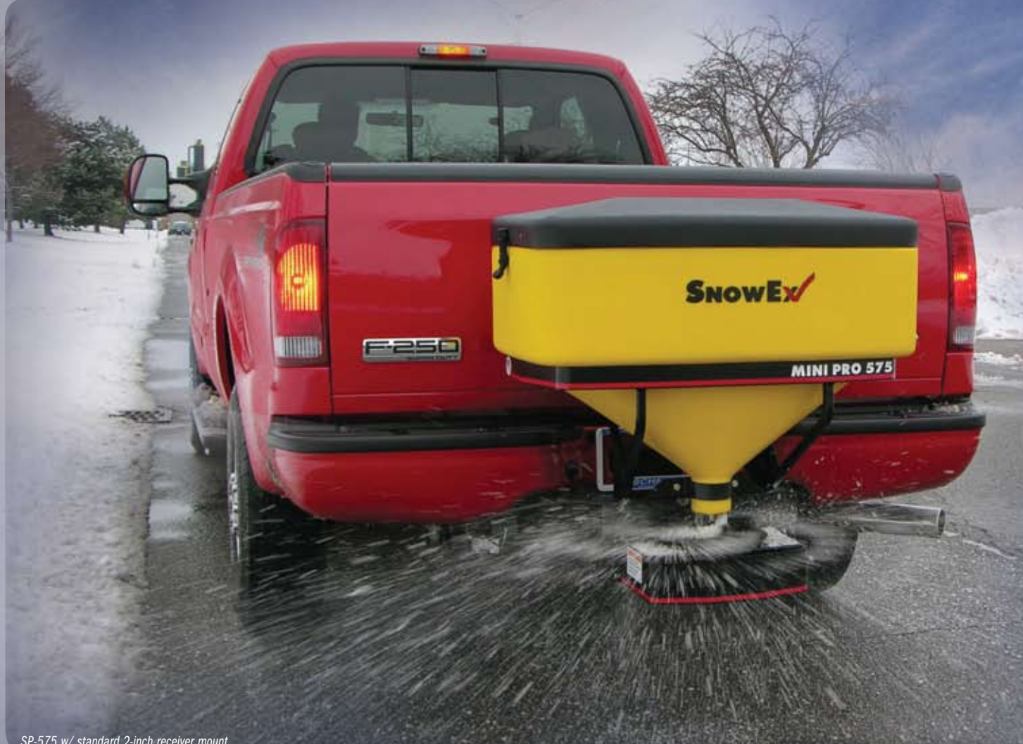
SP-575 w/ standard 2-inch receiver mount

Compact. Precise. One-Person Installation. SnowEx tailgate spreaders cater to everyone from the private operator to commercial contractors and are ideal for maintaining driveways, recreational paths, parking lots and roads. They are available with a variety of sizes and mounts to fit most pickups, SUVs and utility vehicles.