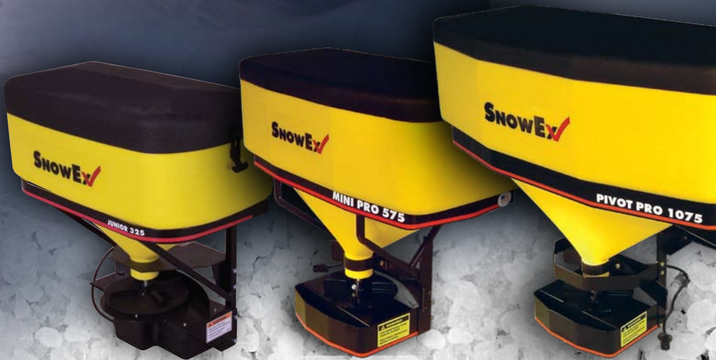
SP-325 JUNIOR CAPACITY: 3.25 cu. ft. (.092 cu. m)