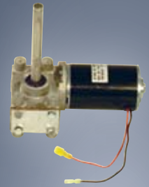
PATENTED SPINNER MOTOR TRANSMISSION UNIT